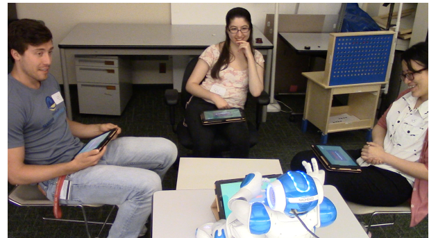
Figure 1: Participants played a collaborative game with a robot, who either made vulnerable or neutral statements during the game.